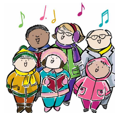
"HERE WE COME H-CAROLING!"

Thanks so much to everyone who joined us for Christmas Caroling to our homebound.